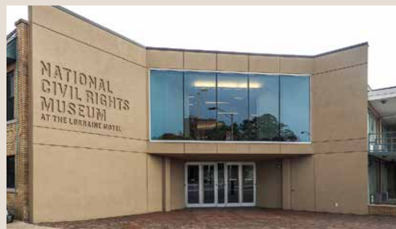
National Civil Rights Museum