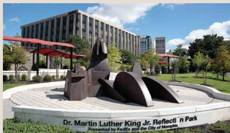
Dr. Martin Luther King Jr. Reflection Park