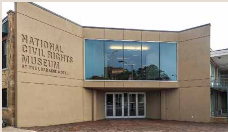
National Civil Rights Museum