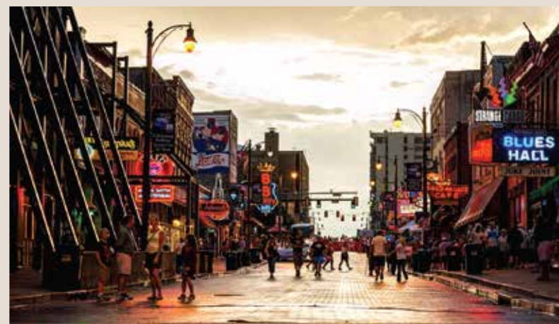
Beale Street Historic District