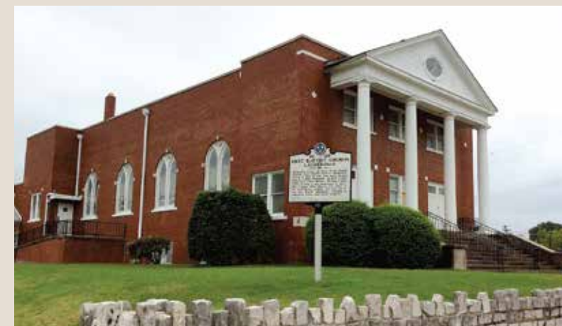
First Baptist Church Lauderdale