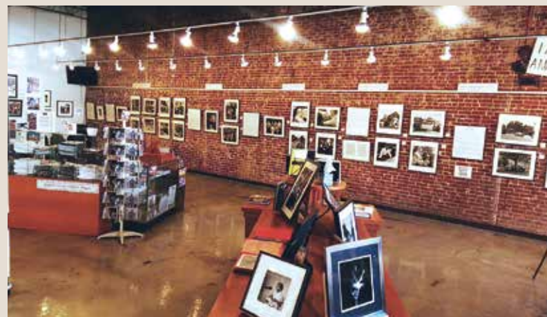
Withers Collection Museum and Gallery