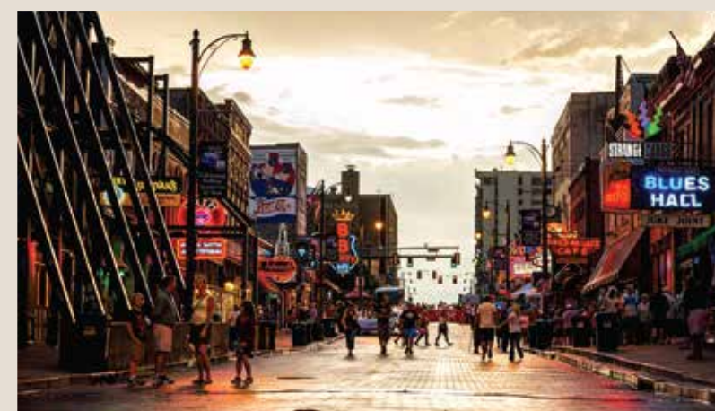
Beale Street Historic District