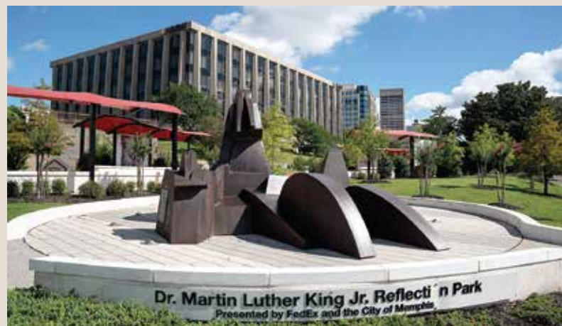
Dr. Martin Luther King Jr. Reflection Park