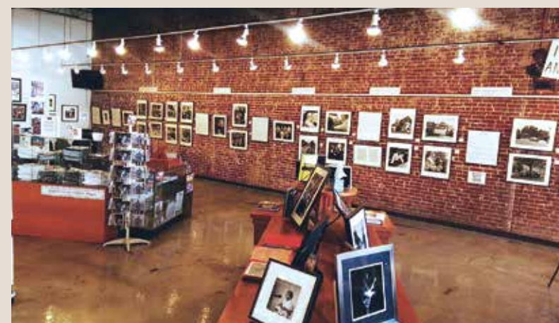
Withers Collection Museum and Gallery