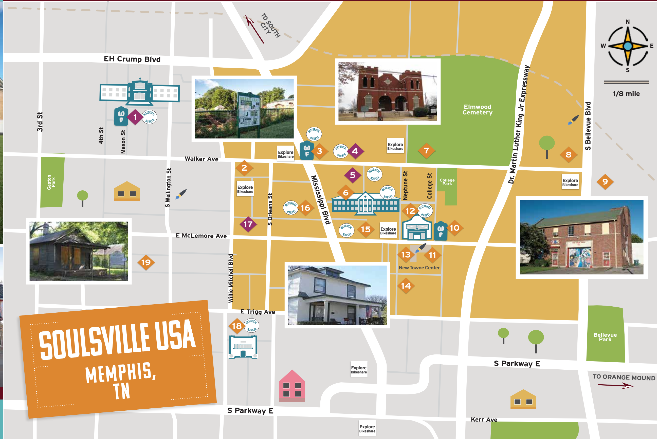
1. Mason Temple, 938 Mason Street Open to the public Monday-Friday. No admission charged. 2. Knowledge Quest/Green Leaf Learning Farm, 590 Jennette Place Public. Open Monday-Friday. 3. People's Grocery Site and Marker/Four Way Restaurant, 998 Mississippi Blvd. Public. Open every day except Monday. 4. Second Congregational Church, 764 Walker Avenue Private. Tours may be arranged by appointment with church. 5. Metropolitan Baptist Church, 767 Walker Avenue Private. Tours may be arranged by appointment with the church. 6. LeMoyné-Owen College, 807 Walker Avenue LeMoyné-Owen is a historically black college in the Soulsville neighborhood. 7. Elmwood Cemetery, Walker Avenue at Neptune Street Public Access at 824 S. Dudley Street (accessed from E.H. Crump Boulevard) Grounds open daily. Office open Monday-Saturday; closed Sunday. 8. Memphis Black Arts Alliance, 985 S Bellevue Blvd 9. South Memphis Alliance, 1048 S Bellevue Blvd 10. Memphis Slim Collaboratory, 1130 College Street Private. Visits may be arranged through the Memphis Slim Collaboratory. 11. Jones Beauty Salon, 941 East McLemore Avenue 12. Stax Museum of American Soul Music, 926 East McLemore Avenue Open Tuesday-Sunday; closed on Monday. 13. Memphis Rox Climbing and Community, 879 McLemore Avenue memphisrox.org. Open to the public. 14. Snowden Art and Conversation House, 883 Stafford Avenue Open to the public by appointment. 15. Roulhac Mansion Bed and Breakfast, 810 East McLemore Avenue Private business. Accessible to the public. 16. J.E. Walker House, 1109 Mississippi Blvd. Private. Visits may be arranged by contacting Soulsville Neighborhood Association. 17. Centenary United Methodist Church, 584 East McLemore Avenue Private. Tours may be arranged by appointment with the church. 18. Royal Studios, 1320 Willie Mitchell Blvd. Private. Exterior view from public sidewalk. 19. Aretha Franklin Birthplace, 406 Lucy Avenue

Presented by the City of Memphis - Division of Housing and Community Development