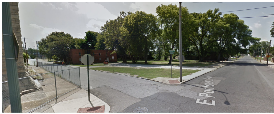
Vacant lot adjacent to Clayborn Temple – proposed site for I AM A MAN Plaza