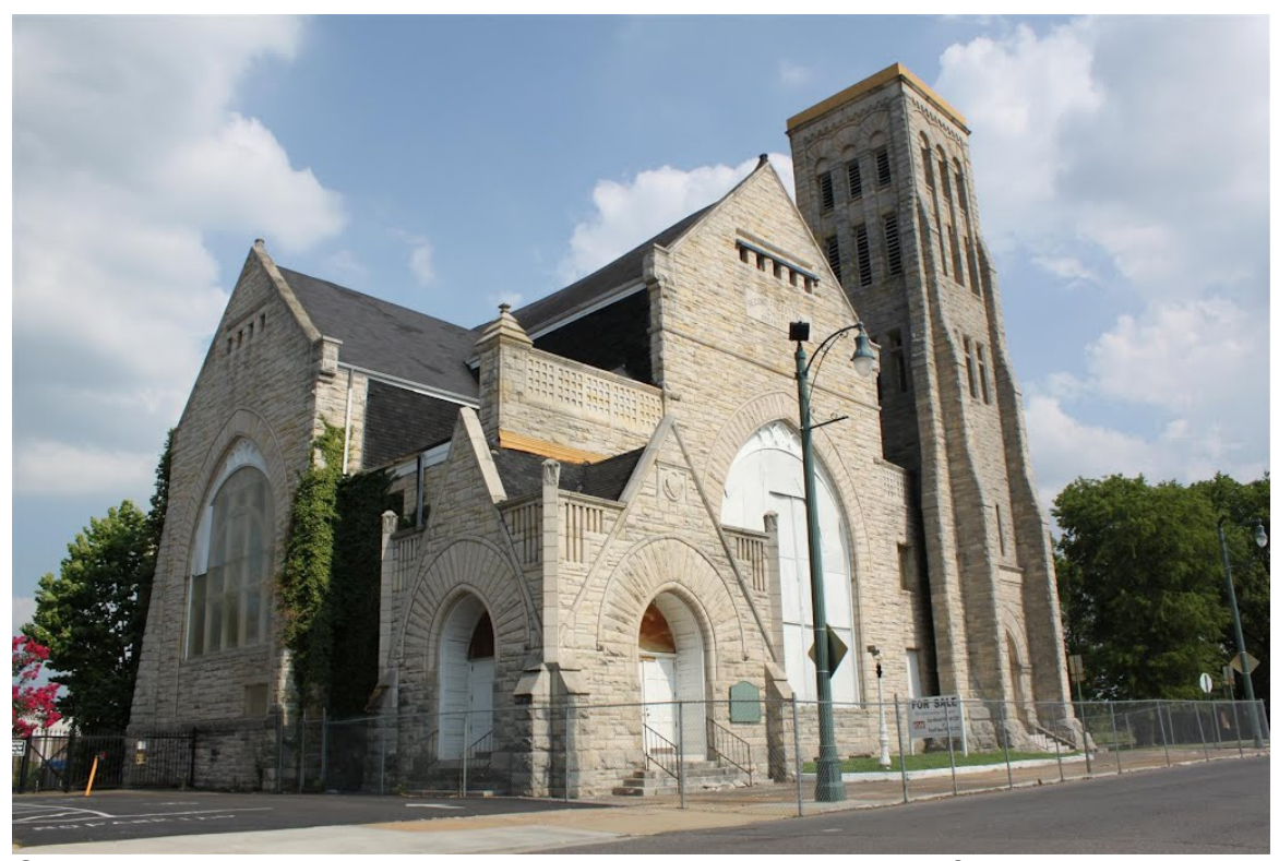
Clayborn Temple, downtown Memphis – at the intersection of Hernando and Pontotoc